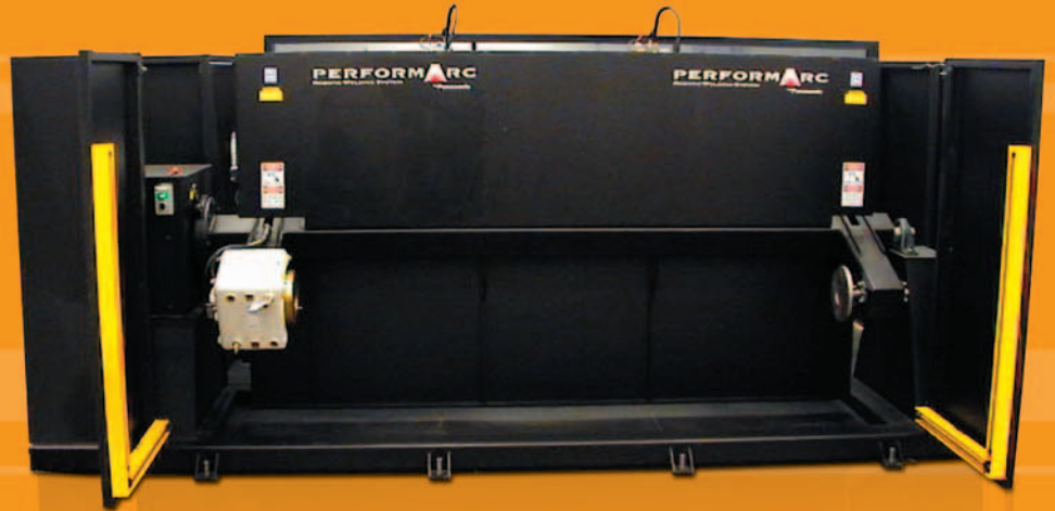
Dual robot PA362S shown